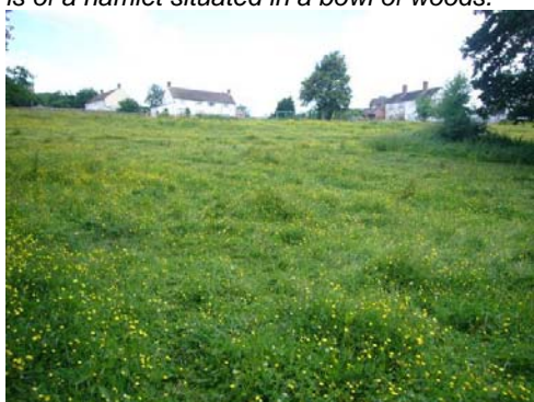
The body of the village sits above a meadow beside the River Cadoxton.