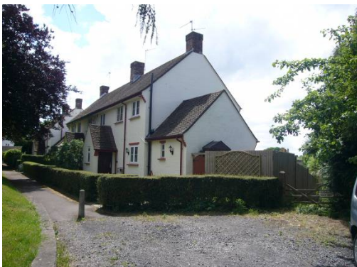
Rural District Council houses form almost half the conservation area's housing stock.