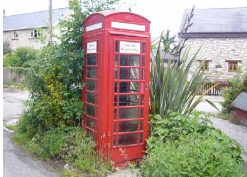
Telephone Call Box.