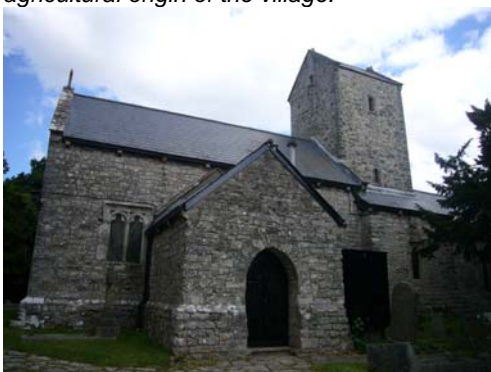
The Church is the focal point of the village.