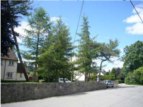
The road widens as it passes through the heart of the village.