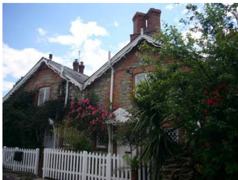
Nos 1, 2 and 3 Church Cottages.