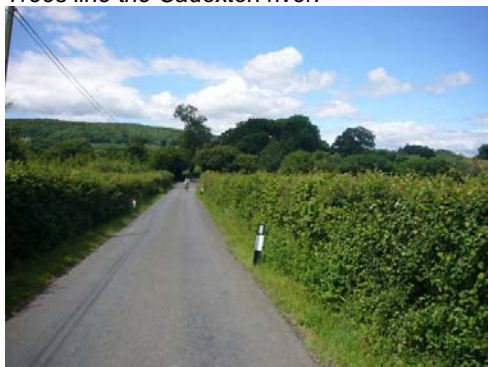
Green approach from Penyturnpike Road.