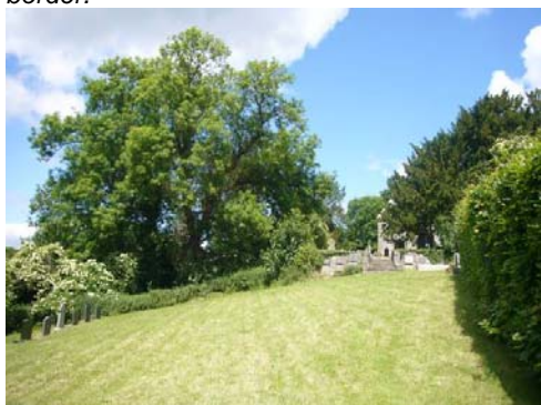
Trees, like this ash beside the church, are a feature of the area.