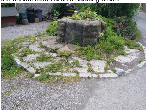
The old wellhead is a reminder of the agricultural origin of the village.