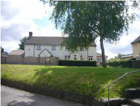
A planned formal open space at Fairleigh.