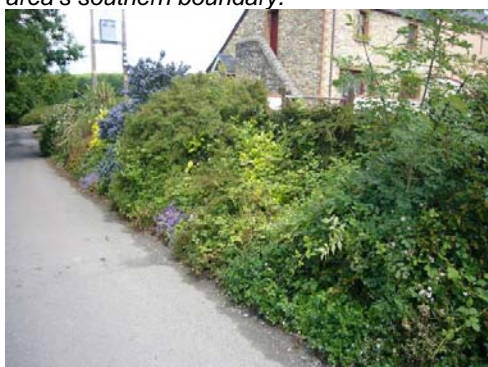
Roadside verge planted like a herbaceous border.