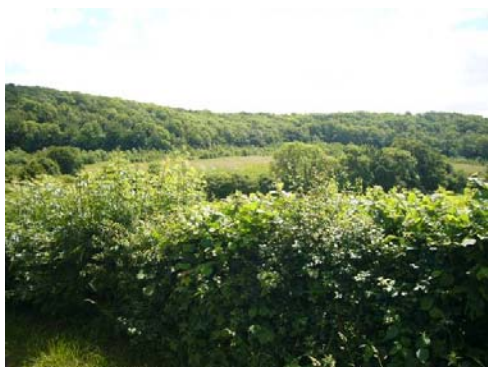
From the road by Y Fron Oleu the impression is of a hamlet situated in a bowl of woods.

The village's oldest buildings do not have a uniform relationship to the road but all are set back from the highway. Twentieth century infill houses are set back from the road, approached by a short vehicular drive. The disposition of the old mill (Felin Dawel) and former farm buildings relates to their original purpose. The RDC houses have been laid out with planned formality: Fairleigh consists of two pairs of semis set at right angles with a green and parking spaces in between; Norman Cottages is comprised of three pairs of semis in an arc facing an area of trees; the two pairs of semis in St. Michael's Close are aligned behind a grassed 'green' raised above road level behind a stone retaining wall. The grassed space of St. Michael's Close forms, in effect, a modern village green on the opposite side of the road to the village's old focus, the wellhead.