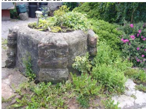
The wellhead is in need of attention.