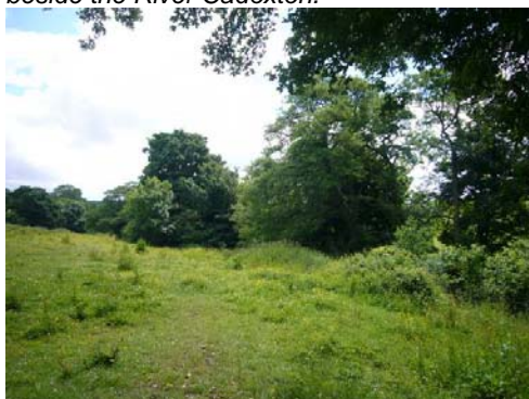
Trees line the Cadoxton river.