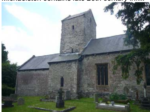
Church of St. Michael and all Angels