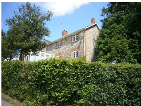
Y Fron Oleu is one of the few late 19th century buildings.