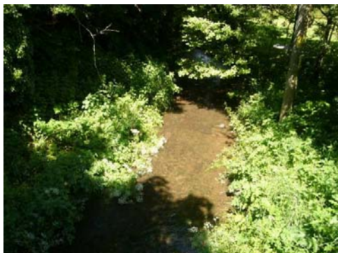
The River Cadoxton forms the conservation area's southern boundary.