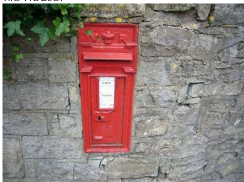
A small feature that adds to the area's special interest.