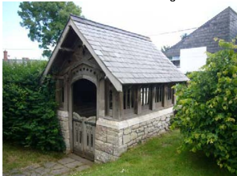
Lych Gate at Church of St. Michael and All Angels