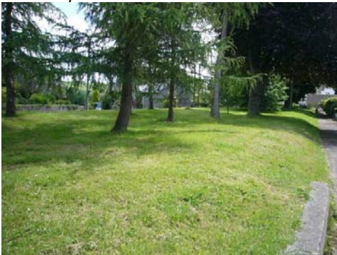
Space in front of St Michael's Close forms a modern 'village green'.