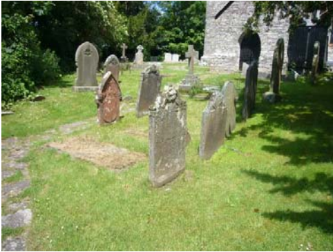
The churchyard of St Michael's is informal and tranquil.