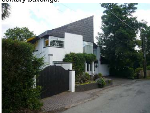
Michaelston contains late 20th century infill.