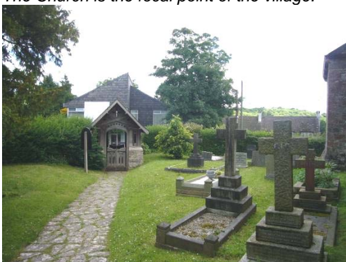
St. Michael's Churchyard.